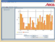
StecaGrid User Visualisation software