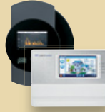
Solar-Log™ and Meteocontrol WEB'log Accessories