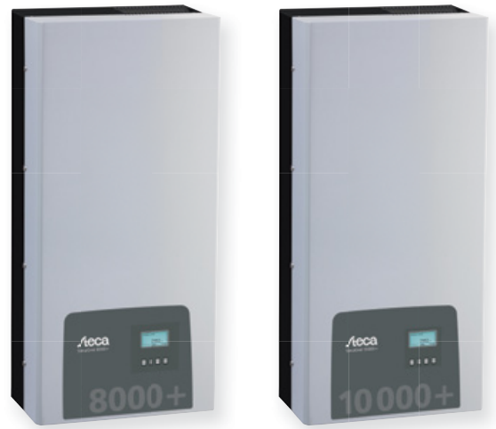
StecaGrid 8000+ 3ph