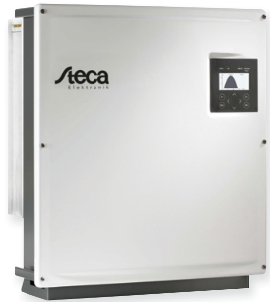
StecaGrid 20000 3p and StecaGrid 23000 3ph, not shown: StecaGrid 40000 3p and StecaGrid 46000 3ph