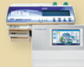
Meteocontrol WEB'log Data logger