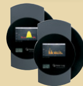
Solar-Log Data logger